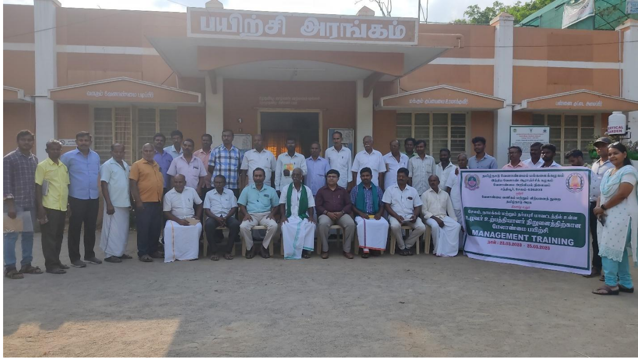
Group Photo in front of KVK Training Hall