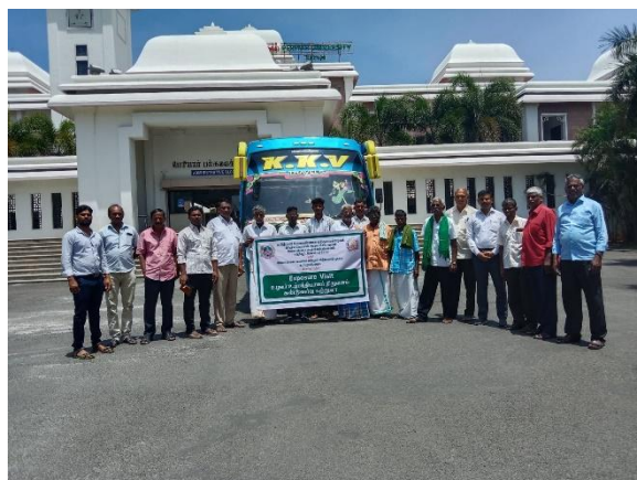
Exposure Visit Photo in front of Vehicle with Flex