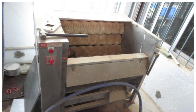
Vegetable like ginger, garlic peeler machine